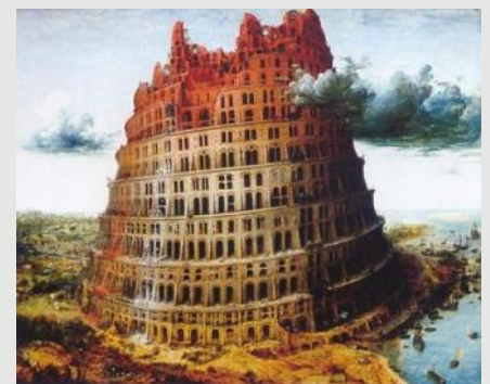
Pieter Bruegel's painting (c.1563) of the Tower of Babel at Boijmans Museum, Rotterdam

in the hands of a king or controlling elite are made repeatedly in the Old Testament. This narrative argues that the EU fails on both counts, in that it wrests sovereignty from the nation-state and centralises power in Brussels.