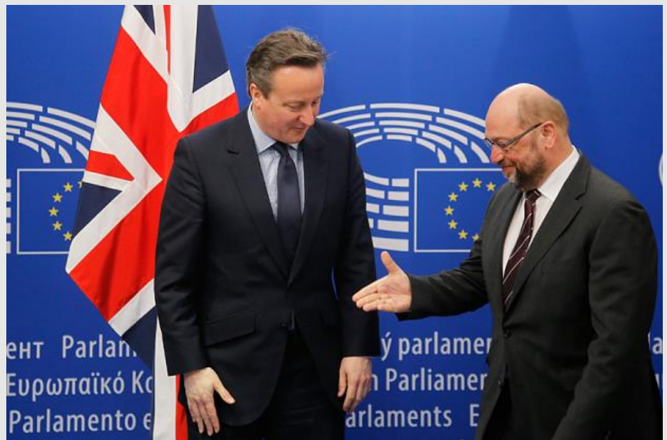
UK Prime Minister David Cameron meeting with President of the European Parliament, Martin Schulz

(As Christian citizens) we'll need to define what is our faith perspective on the EU, just as we need to continually define our perspective on our own nation-state and its component parts and to all other international institutions with which we necessarily interact in an increasingly interconnected and interdependent world.