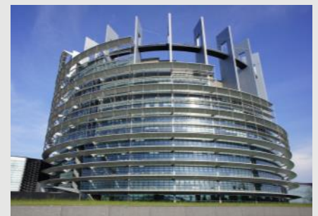
The European Parliament Building in Strasbourg, inaugurated in 1999

A third narrative was put forward by others who observed that the Bible is supportive of nations but critical of centralised power. Michael Schluter 3 argues this point in his writings: "In both Old and New Testaments, people are differentiated by culture, language and national identity; this is seen positively as God's will, and thus we should not discard it lightly". At the same time, the dangers of concentrating political and economic power